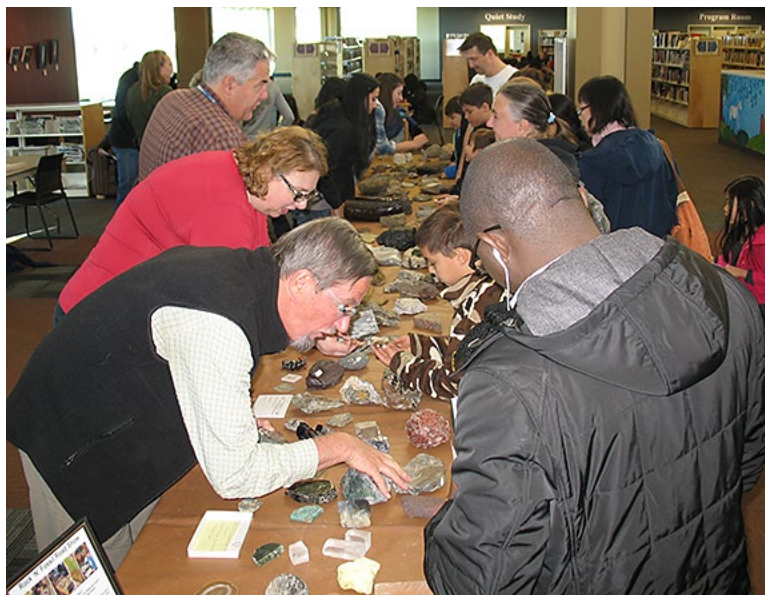
Geoscientists discuss rocks, minerals and fossils with members of the public.

Volunteers arrived at the library to set up at approximately 10:00 A.M. Visitors began to gather quickly dur-