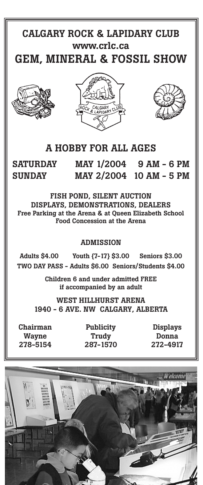
Another big success: The 2004 APS Symposium attracted a good crowd, including this future palaeontologist.

Look for the Alberta Palaeontological Society and Archaeological Society of Alberta booths at the CRLC Show, May 1 and 2.