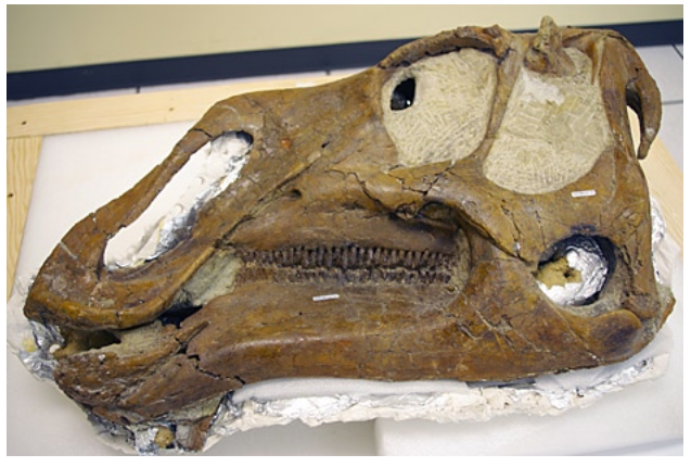
Figure 2. Gryposaurus skull on dislplay at the symposium.

Thirty-four talks were given during the two-day conference. It was truly an international affair with talks and posters from four continents.