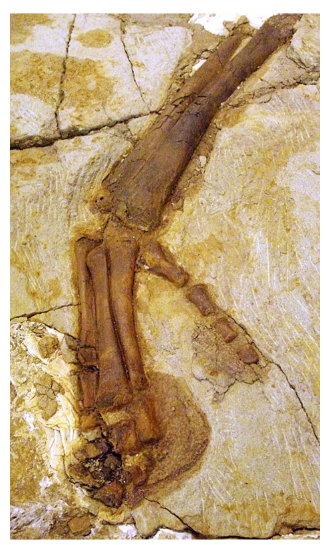
Figure 3. Mummified hadrosaur hand (manus) showing preservation of fleshy pad.

We loaded the bus early in the morning and were transported to the Park. Upon arrival, David Eberth