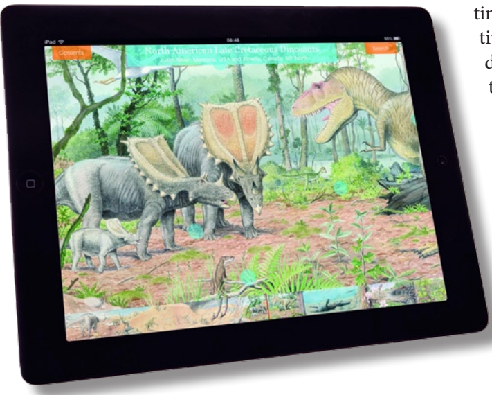
Figure 2. An example of the elegant art work on the Timeband showing Late Cretaceous dinosaurs; there are about 100 different illustrations like this one displayed continuously along the Timeband. Tapping on the screen reveals blue dots that can be tapped to get details on the organism next to the dot. The lower band on the screen allows for more rapid scrolling to specific parts of the Timeband.

for the Ediacaran, the Burgess Shale for Cambrian diversification, Miguasha and Ellesmere Island for the emergence of tetrapods in the Devonian, Joggins for its Carboniferous fossil plants and first reptiles and the Cretaceous dinosaurs of Alberta (Figure 2). The great aspect of the Timeband is that you can scroll through it at your leisure tapping blue dots to gain new information and it is a truly enormous amount of information on many of the world's greatest fossil localities. If you want to find something quickly, there is a smaller scrolling bar at the bottom of the screen that allows you to scroll more quickly to individual stories.