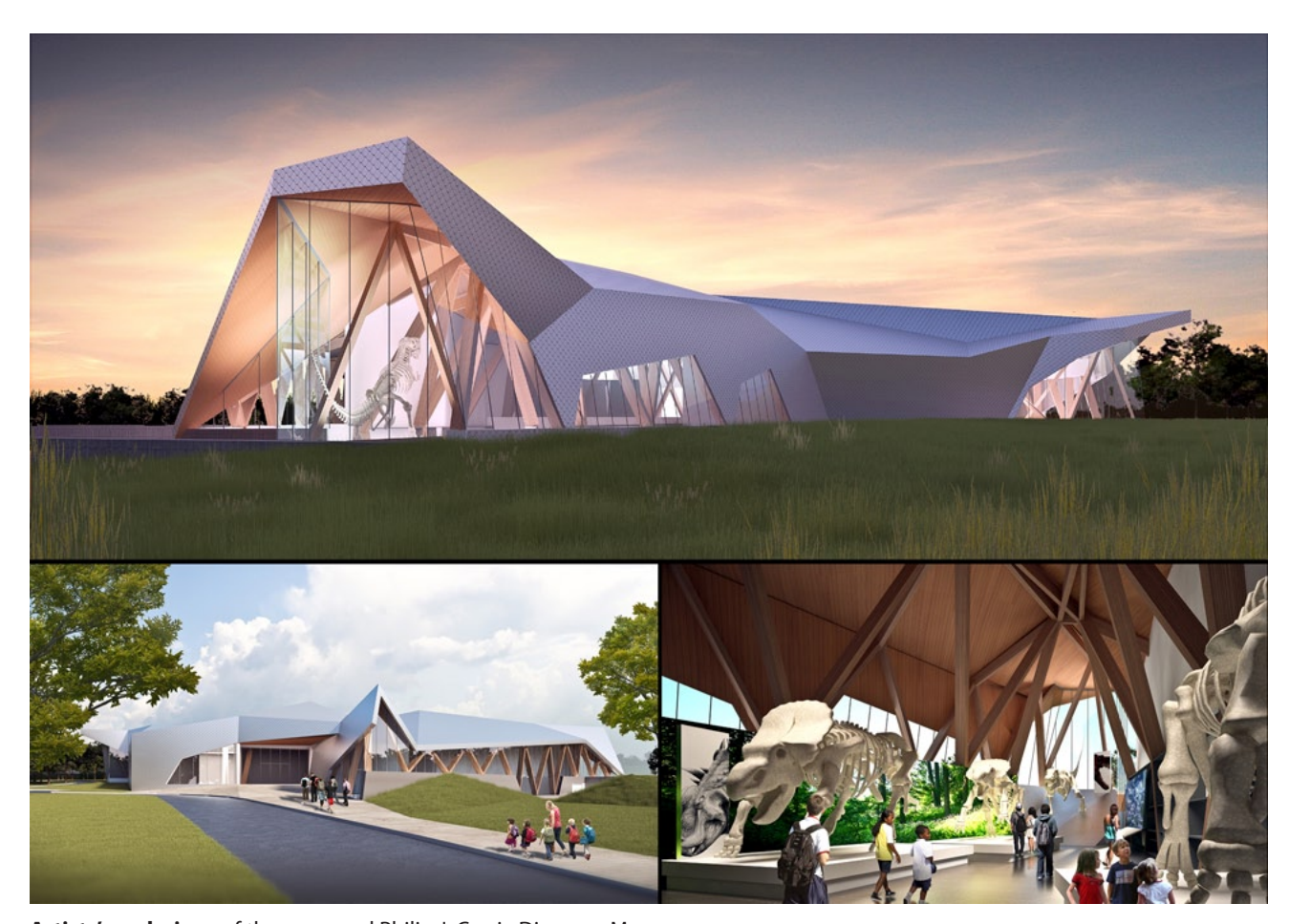
Artists' renderings of the proposed Philip J. Currie Dinosaur Museum.