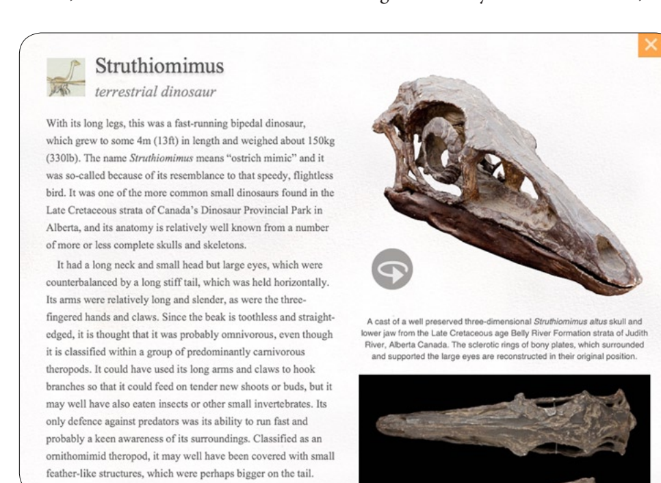
Figure 4. An example of a partial page obtained by tapping on an image of one of the fossils (a Struthiomimus skull) under the Exhibition button. Tapping the curved arrow will enlarge the image and allow it to rotate 360 degrees.

This brings me back to the price. My conclusion