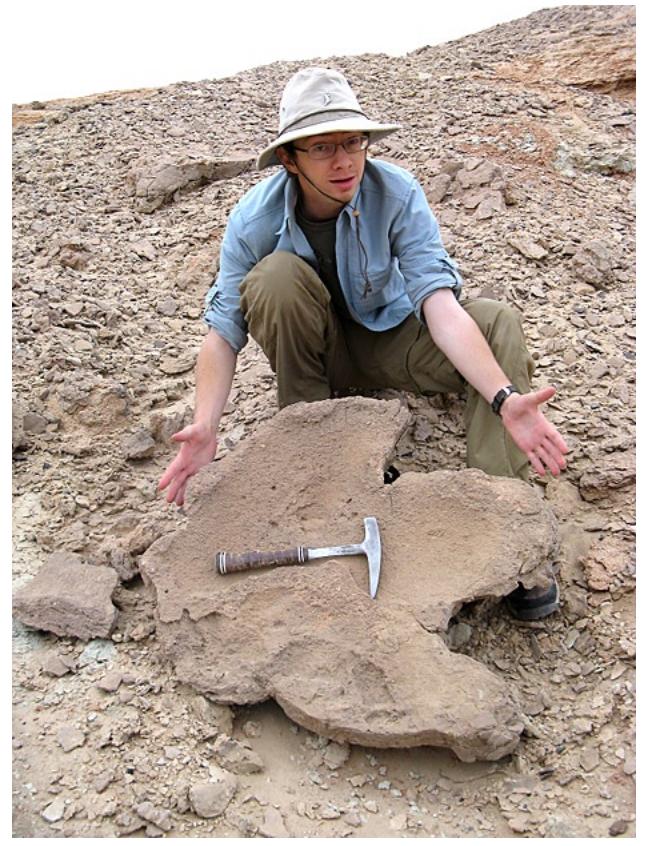
Dinosaur footprint natural cast in the field.