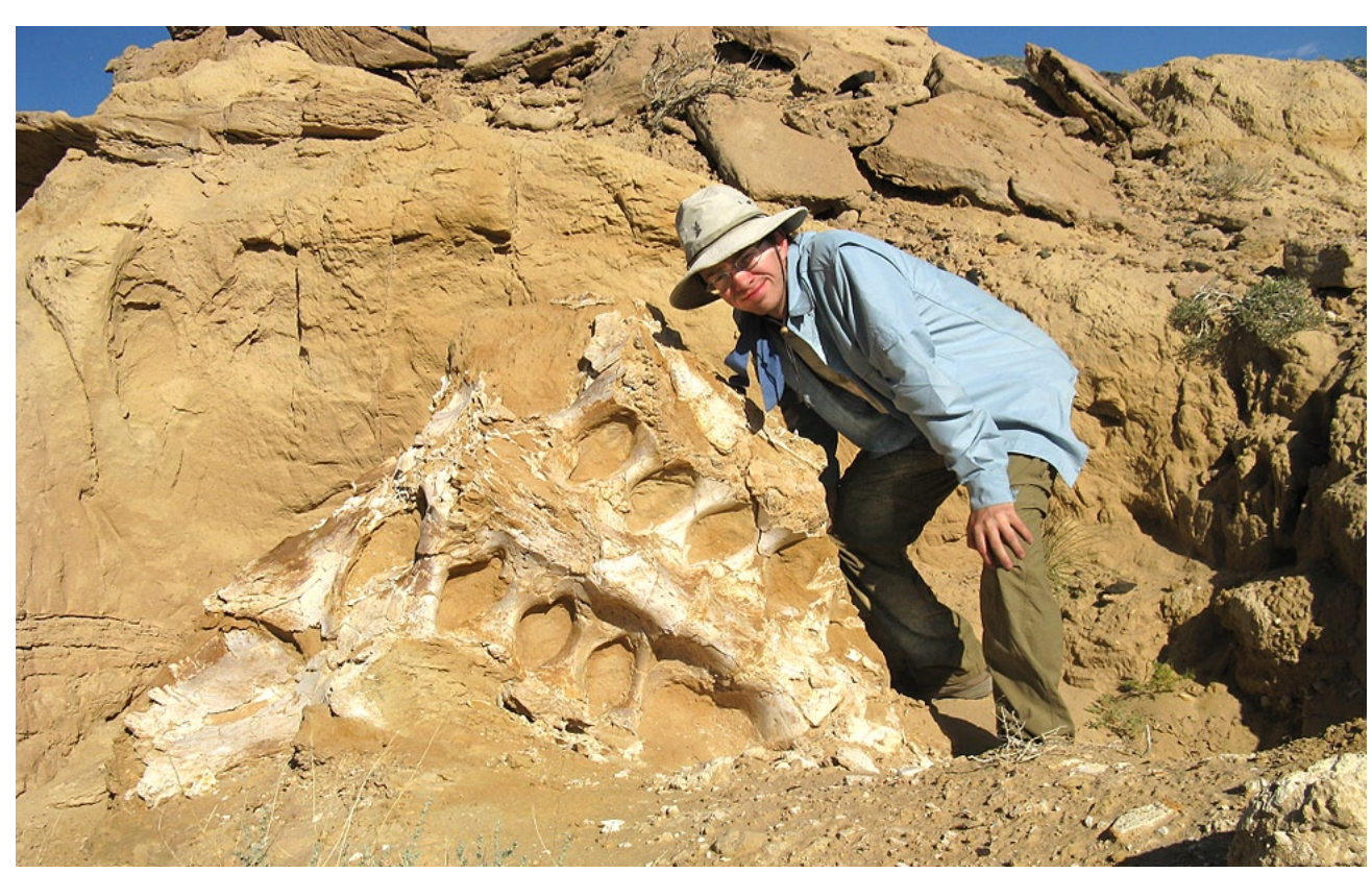
A spectacular specimen found in the Gobi Desert, Mongolia.