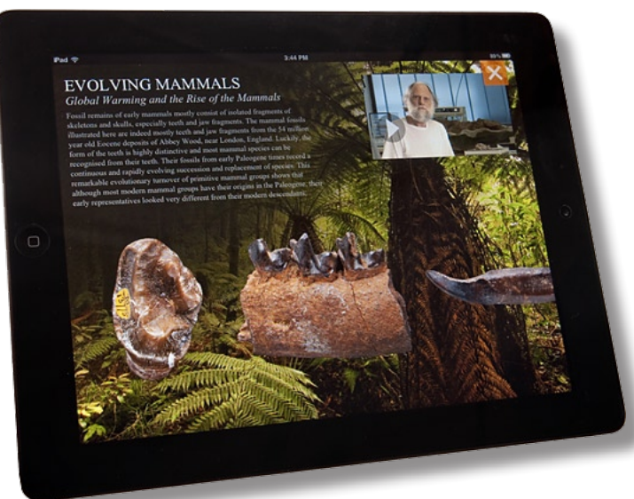
Figure 3. An example from the Events button on "Evolving Mammals". The video of a scientist speaking about the event is available by tapping on the play button in the upper right.

Another part of this extensive app is a scrollable series of seventeen Timeline Events from the origin of life to the origin of human art. Most of these events have an audio component so that you can listen to a commentary on the event (Figure 3). There is a possible glitch here, because if you stop a narration for one event and move to another and click the audio button on the new event, the narration from the previous event continues. If you wait a while, the right narration becomes active. The message is that you should listen to the whole narrative—not a bad lesson for the fast and fickle fingers of iPad users. On many of these event pages there are featured videos with scientists from the Natural History Museum describing the event.