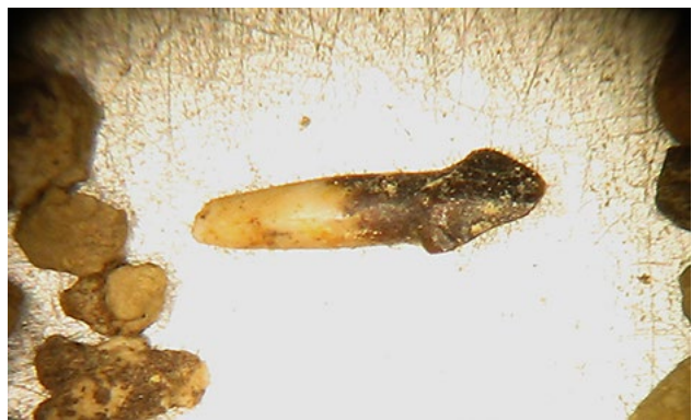
Photomicrograph of a small mammal tooth with root. No scale included, but tooth would be less than 10 mm in length.