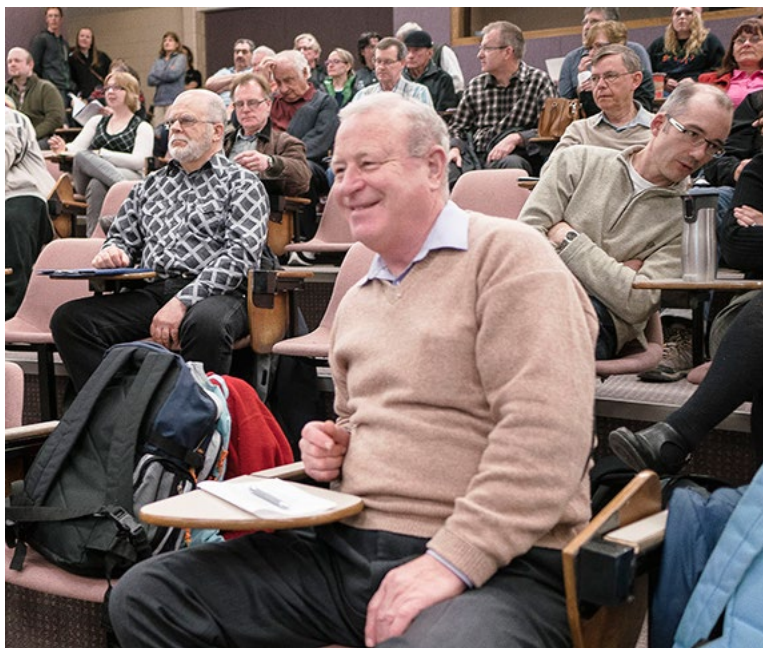
Jenkins Theatre talks were entertaining and well attended.