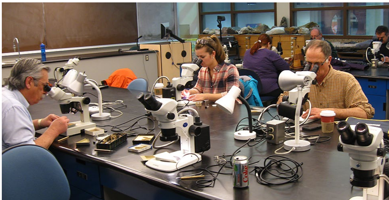
APS volunteers searching for microfossils in Mount Royal University's geology lab.